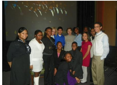
PFF students pose with Former First Lady, Laura Bush.